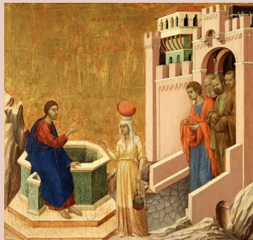
Christ and the Samaritan Woman by Diago di Buoninsegna Thyssen-Bornemisza Museum, Madrid, 1310

This Sunday we have the story of the Woman at the Well in John chapter 4. There is clear misogyny in the history of interpretation related to the woman in this text. We will try to give her the credit she is due.