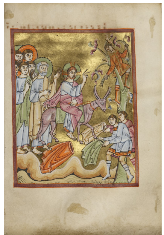
The Entry into Jerusalem, about 1030 - 1040, Ottonian, unknown author Regensburg, Bavaria, Germany (Place created) The J. Paul Getty Museum, Los Angeles