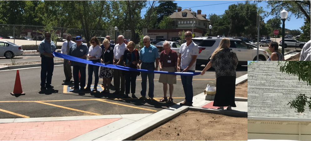
Alarcon Street Ribbon Cutting Celebration