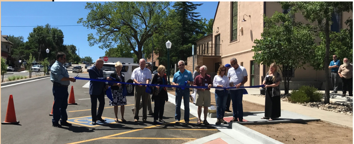
Alarcon Street Ribbon Cutting Celebration