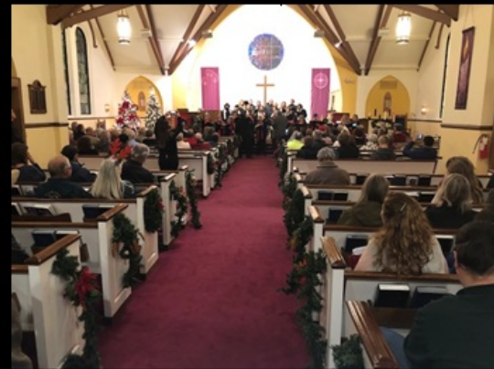
Acker Night ~ Tapestry & Caborca Choir