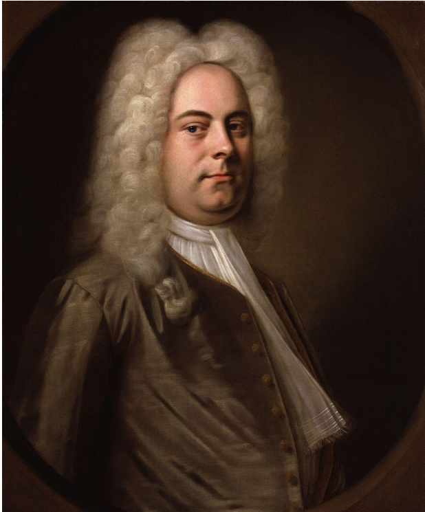
George Frideric Handel by Balthasar Denner