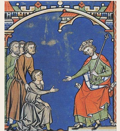
Illustration from the Morgan Bible of Mephibosheth kneeling before David.

This Sunday is World Communion Sunday. Christians around the world will gather to observe the Lord's Supper or Holy Communion. We will do so as well. Our text is 2 Samuel 9 and introduces us to Mephibosheth. In addition to having a tough name, he had a tough life until King David rescued him. It's a gospel story in many ways - new life, a seat at the table, becoming part of the family, and enjoying an inheritance. We have much in common with Mephibosheth!