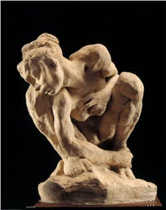
Auguste Rodin (1840 -1917) Crouching Woman, also known as Lust Circa 1881-1882 - Musée Rodin, Paris, France