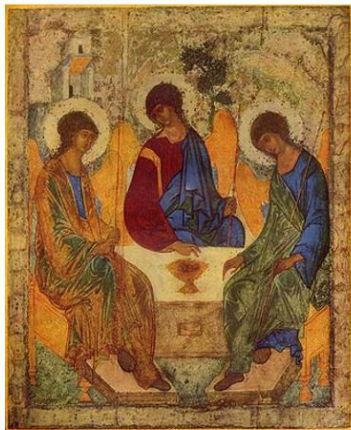
Russian icon of the Old Testament Trinity by Andrey Rublev, between 1408 and 1425

This Sunday is Trinity Sunday and Father’s Day. Rublev’s famous icon is an interesting image of the Trinity. Space does not permit me to go into all the detail. I refer you to Wikipedia for all the symbolism. I thought having a female depiction of the Trinity for Father’s Day would be a good corrective to the “God the Father as man” notion. God is a Spirit (John 4:24). So, Sunday we will contemplate our image of God and how God patiently works with us (John 16:12-15)