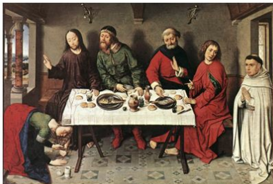
Christ in the House of Simon by Dieric Bouts

As Lent nears its end and Jesus prepares to begin his journey to the cross, the lectionary gives us a text about Mary's lavish expression of love for Jesus, and also foretelling his burial (John 12:1-8). Mary and Judas are contrasted. Lavish devotion or stinginess on display. So