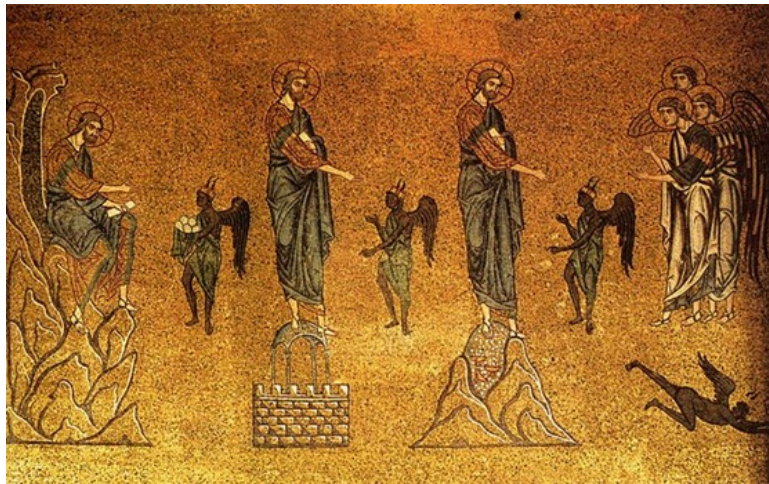
The Temptations of Christ, 12th century mosaic at St. Mark's Basilica, Venice