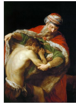
The Return of the Prodigal Son (1773) by Pompeo Batoni

The word “prodigal” is not used much these days. The parable of the prodigal son in Luke 15 may be the only reference we have for the word. Therefore, it has a negative connotation, as in “wasteful.” The prodigal son wasted his inheritance in riotous living, the text suggests. The word “prodigal” means wasteful, extravagant, lavish. There are all kinds of ways of looking at this story told by Jesus. It has been told from the viewpoint of the younger son, the older son, the father, the missing mother and daughters (who keep everything together and roll their eyes while the father and sons do their power plays). Some