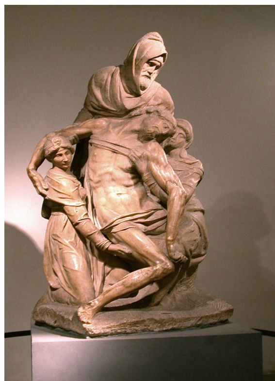
Nicodemus helping to take down Jesus' body from the cross ( Pietà , by Michelangelo). Pietà nel Museo dell'Opera del Duomo di Firenze.