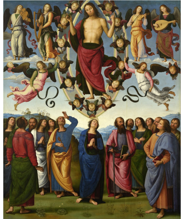
Pietro Perugino 1496–1500 Musée des Beaux-Arts de Lyon, France