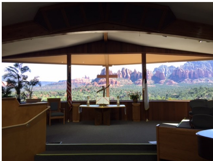
“Church of the Red Rocks”, inside the sanctuary.