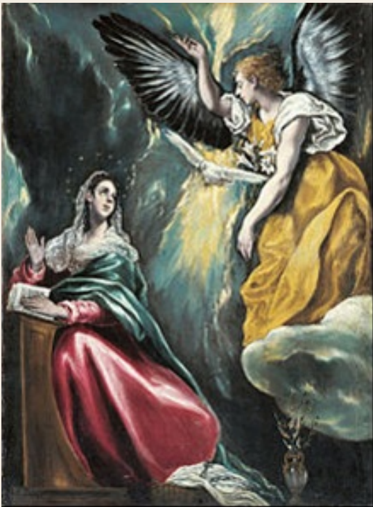
The Annunciation by El Greco, c. 1590-1603, Ohara Museum of Art, Kurashiki, Japan

Merry Christmas! This Sunday, Christmas Eve, we will gather for worship at 10:30 am and 7:00 pm. Whether you come to one or both, there will be plenty of cards to sing and the traditional singing of “Silent Night” with our individual candles. We decided to add it to the morning service for those not returning at night. The sanctuary is decorated in “post card like” Christmas beauty, and it takes on an almost magical feel at night.