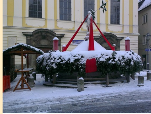
Giant Advent wreath in Kaufbeuren, Bavaria, Germany

Advent begins! (Matthew 24:36-44) On this First Sunday of Advent, we always focus on hope and the second advent of Christ. As we prepare to celebrate Christmas, it is good to be reminded that it is the second advent that brings ultimate redemption, peace, and justice. We live in the tension between Christ's two advents, between the "already" and the "not yet." Our task is hopeful, active, alert waiting. The words of Jesus in this text are apocalyptic – a special type of biblical literature popular in his day. The cosmic nature of the language was meant to provide hope and assurance to oppressed people – this life is not all there is – God is coming with a new future. "Such thinking should keep our souls athletically trim, free from the weight of the excessive and useless. Such thinking should keep gains and losses in their proper perspective. Such thinking should chase away the demons of dulling dissipation and cheer us with the news that not only today is a gift of God, but also that tomorrow we stand in the presence of the Son of Man." (Fred Craddock)