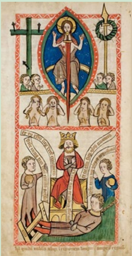
Parable of the Talents, artist unknown, circa 1360, Universitäts- und Landesbibliothek Darmstadt, Germany

Sunday's text is the parable of the talents in Matthew 25:14-30. A parable is a story that usually makes one point, but often it is open to several interpretations and layers of meaning. And parables can be startling, disturbing, or challenging. This one has it all.