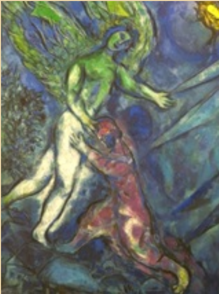
Jacob Wrestling with the Angel, Marc Chagall, 1887-1985