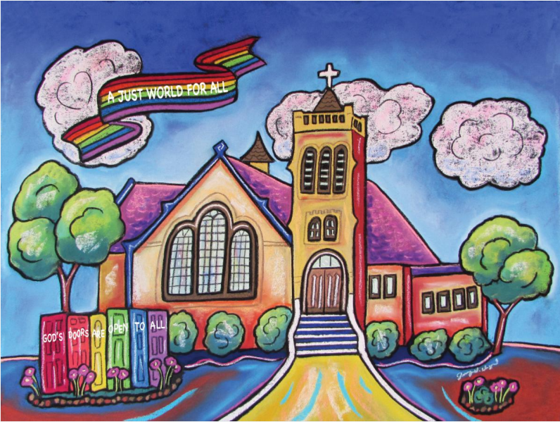
CHURCH PAINTING ON DISPLAY THIS SUNDAY IN PERKINS HALL