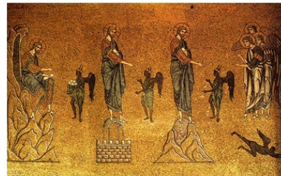
The Temptations of Christ. 12th century mosaic at St. Mark's Basilica, Venice

Lent has begun! On the first Sunday of Lent, we will focus on the traditional first Sunday theme of Jesus' temptation in the wilderness (Matthew 4:1-11). If you have visited St. Mark's Basilica in Venice, there is a mosaic in the church that illustrates the three temptations very well - see if you can remember what the three were from looking at the mosaic.