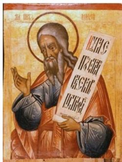
Micah the prophet, Russian icon from first quarter of 18th century Iconostasis of Transfiguration church, Kizhi monastery, Karelia, north Russia

Enjoy light hearted expressions of love as well as tragic heartbreaking moments in select opera pieces. Composers of every age have been inspired by the great love stories of history. Well loved arias include "Mon coeur" from Samson and Delilah and "Porgi amor" from The