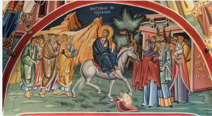
Eastern Orthodox fresco in Nativity of the Theotokos Church, Bitola, Republic of North Macedonia