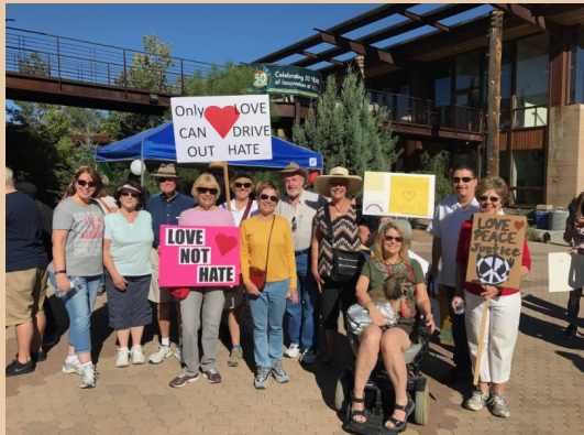
As many as 17 of our congregation participated in the Peace and Unity March, September 16th.