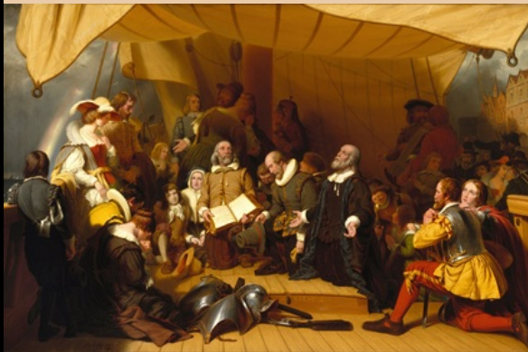
The Embarkation of the Pilgrims (1857) by American painter Robert Walter Weir at the United States Capitol in Washington, DC

It is only appropriate that our stained-glass window contain a pane for the Mayflower since we are faith descendants of the Pilgrims. Forgive the history lesson, but it is essential that we differentiate Puritans from Pilgrims: